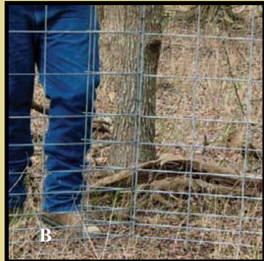
Figure 5. Panel secured to a head gate T-post with doubled wire (A). Remaining panels are attached to one another. It is very important to overlap the ends of the panels (B).

For most corral traps, it is easier to attach all of the panels to one another prior to driving the T-posts. Once all panels are in place and secured, the trap can be shaped by pulling the panels to their desired location (Fig. 6). If the trap is in a wooded area, trees are often used for support.