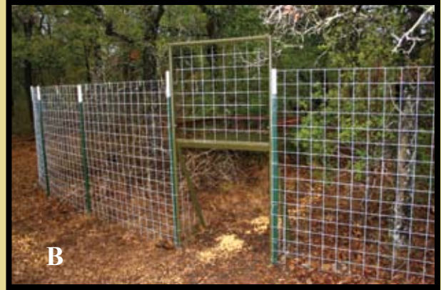
Figure 8. Saloon-type doors require springs for closure (A). Lifting doors can be set in an open position, and once triggered, additional hogs can push their way inside the trap. This model is a lifting gate modified to act as a drop gate on initial capture. After triggering, the gate will close but permit additional hogs to enter (B).

For large corral traps, the trigger should be placed at the back of the trap, away from the door. This allows many hogs to enter the trap prior to door closure. Most trap triggers are made with wire. Some individuals use picture framing wire, as it is durable enough to spring the trap but will break if a hog becomes entangled. The wire is attached to a two-by-four or other prop mechanism on the trap door and is run to the back of the trap, where bait is placed in a hole or scattered on the ground (Fig. 9). T-posts or trees are used to support the wire from the trap door to the back of the trap. Construct wire eyelets and attach them to the T-posts or trees. As hogs root for the for bait, the wire is stretched and the prop is pulled out, triggering door closure.