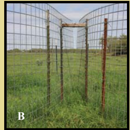
Figure 3. Heart-shaped or Wexford trap. The number of T-posts used depends on trap size and configuration (A). As hogs gather in the chute, they will push their way inside the trap (B).