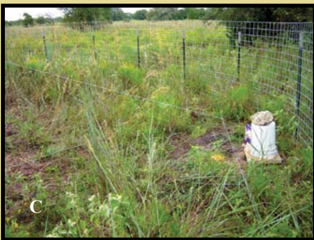
Figure 9. A board is used as a prop on a saloon type door (A). T-posts guide the wire from the prop to the back of the trap (B). The wire is then attached to another wire at the trigger (C). As hogs feed on the bait, the wire is stretched, and the prop pulls from the door.