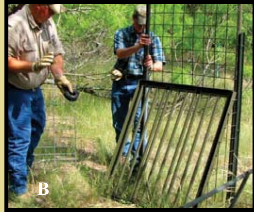
Figure 4. Use steel T-posts to secure a head gate (A). Make sure the head gate fits snugly against the T-posts using a doubled strand of baling wire (B).

Once the head gate is in place, use the panels to form the desired shape of the trap. Trap size, shape, and number of T-posts are dependent upon the number of panels used and whether the trap location is in the open or a wooded area. Secure panels to the head gate T-posts with doubled wire (Fig. 5A). Next, secure the remaining panels to one another. Be sure to overlap the panels at least 6-8" when tying them together. For most panels, this overlap will be one or two mesh squares (Fig. 5B). Attach the panels as securely as possible using doubled baling wire and/or hog rings. Hog rings and pliers can be purchased at your local hardware store.