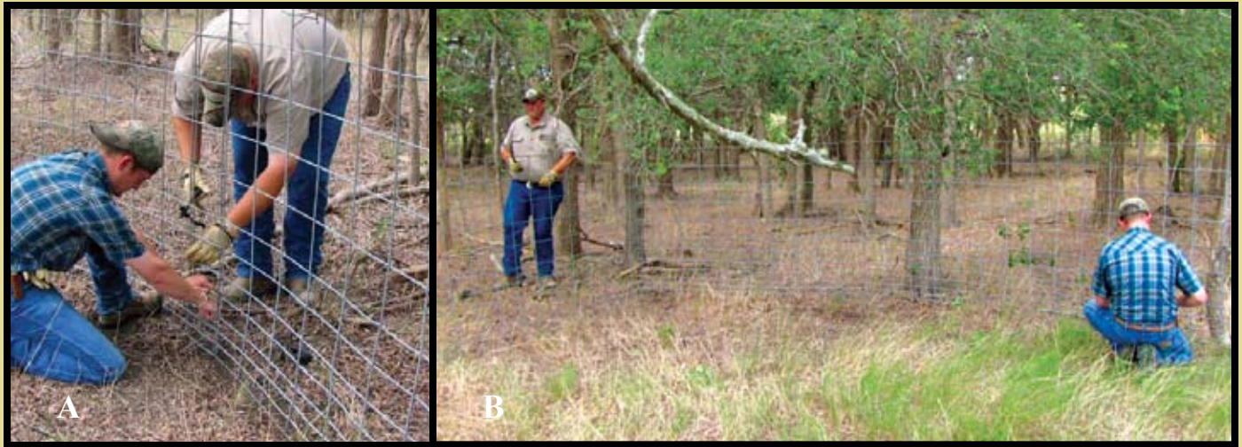
Figure 6. An extra pair of hands is helpful when attaching panels. One person holds the panels in place while the other secures them (A). After all panels are secured, the panels are pulled to their desired location (B).

Once the trap is in the desired shape and location, use T-posts to anchor the trap (Fig. 7). T-posts should be spaced approximately 4' apart. Feral hogs are extremely strong and will test the trap when captured. Do not assume that the trap can be overbuilt. A captured hog can do serious damage to even the sturdiest of traps, and those made of weaker materials may allow hogs to escape altogether. Always make traps as strong as possible.